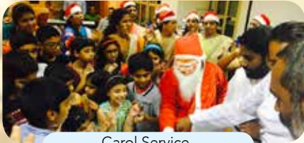
Carol Service Sevika Sangham