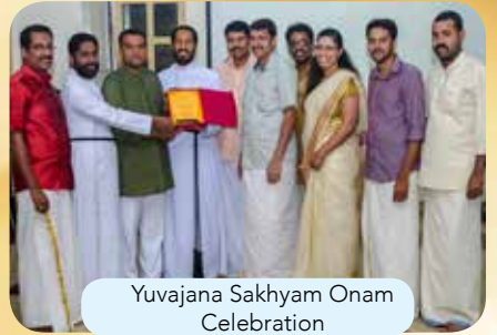
Yuvajana Sakhyam Onam Celebration