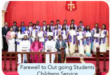
Farewell to Out going Students Childrens Service