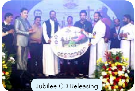
Jubilee CD Releasing