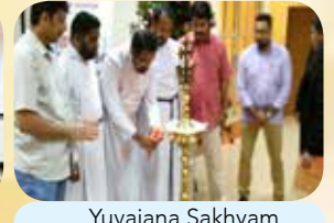
Yuvajana Sakhyam Prathibha Sanghamam