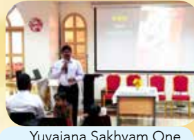
Yuvajana Sakhyam One Day Retreat