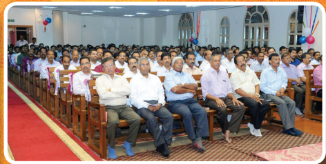
49th Parish Day & Golden Jubilee Inauguration