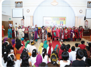
Annual Day Programme