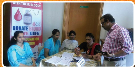
Blood Donation - CMF